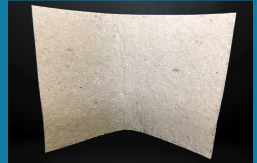
Absorbs up to 3.2 gal./each 32"W x 48"L