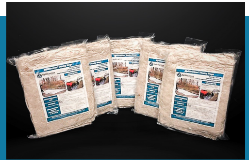
Spilltration® Husky Oil Filter Rug Smooshed Case: SPL007 (5 rugs per case)