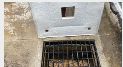
Extra-strength magnets for easy installation and removal.