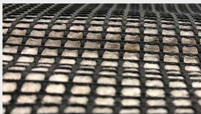
Heavy-duty polyethylene mesh top for drive over durability.