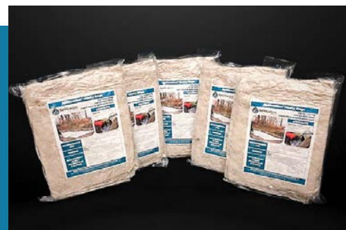
Spilltration® Husky Oil Filter Rug Smooshed Case: SPL007 (5 rugs per case)