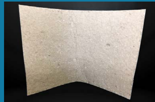
Absorbs up to 3.2 gal./each 32"W x 48"L