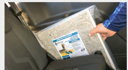
Stores easily under seats, behind seats, or in toolboxes and utility chests.