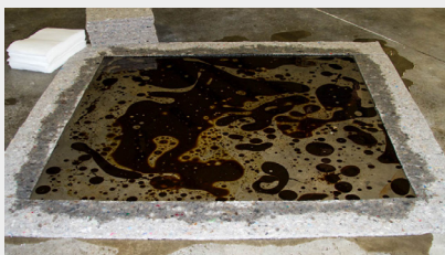
Use Husky Strips to capture oil and let clean water filter through.