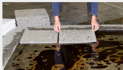
Use Husky Pads to clean up bulk oils and fuels or place them under leaks.