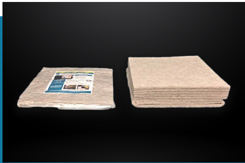
Spilltration® Basic SmooshKit SPL082 (3 kits per case)